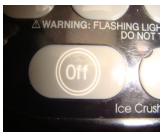
22. Press "off".