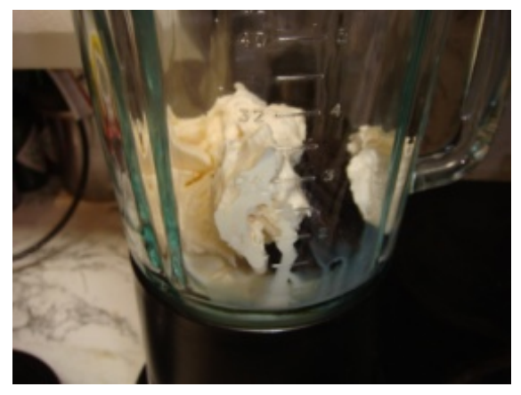
17. Put milk in mixer.