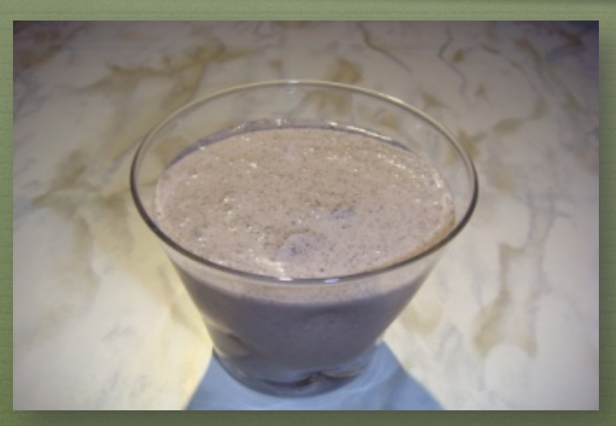
Spectrum Visions Global, Inc.