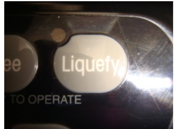
21. Press "liquefy".