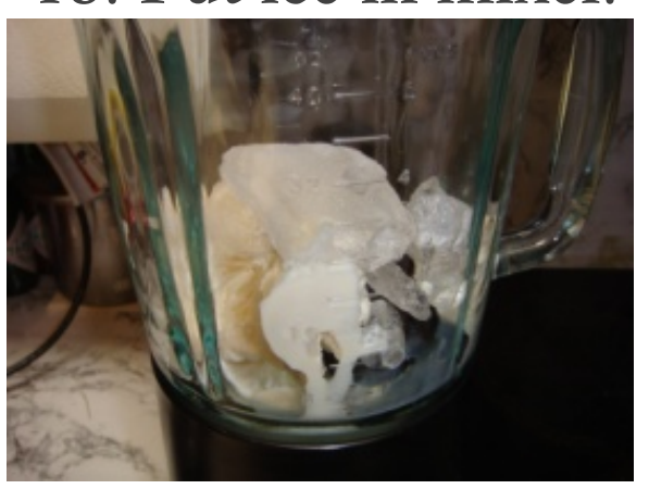
18. Put ice in mixer.