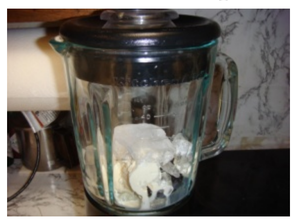
19. Close cap.