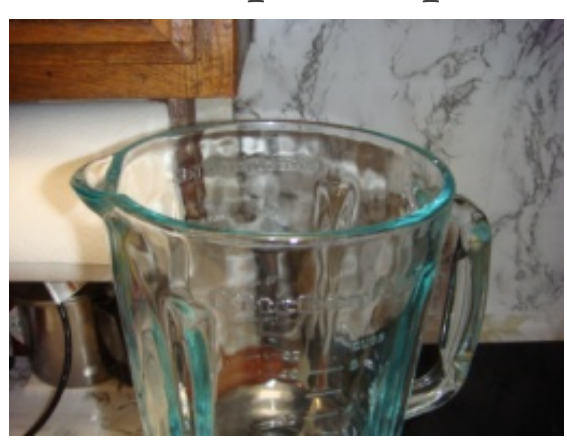
14. Open cap.