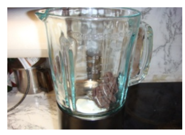
15. Put Oreo in mixer.