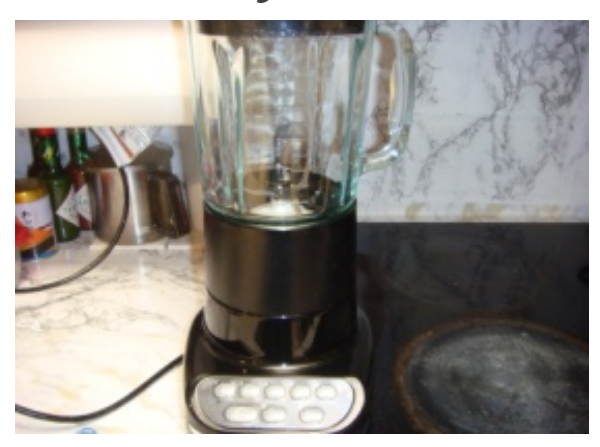
13. Get juice mixer.