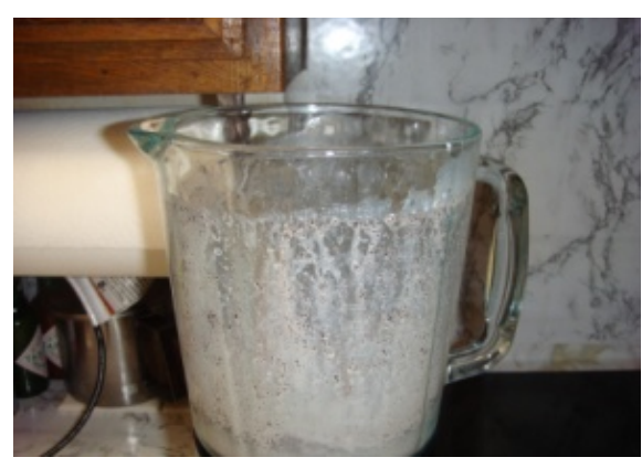
23. Open cap.