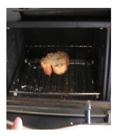
Open the toaster and take out the bread