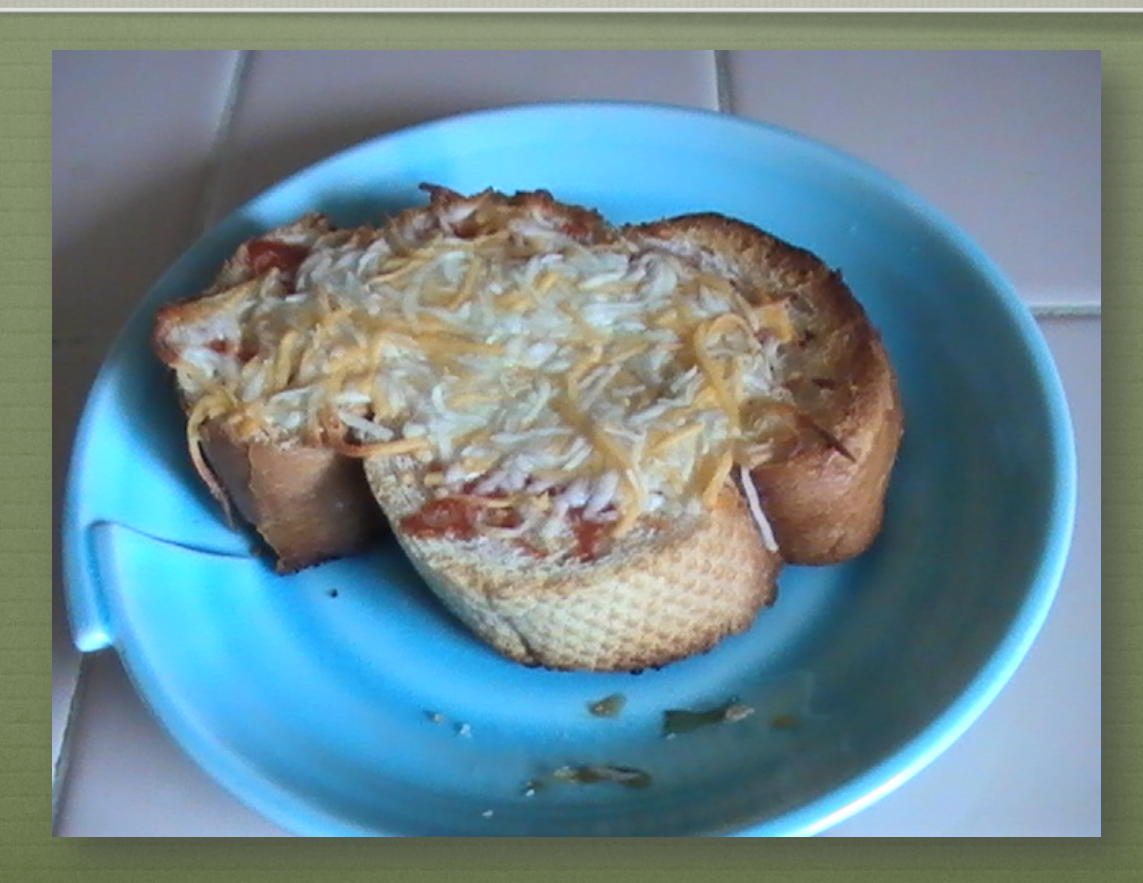
Spectrum Visions Global, Inc.