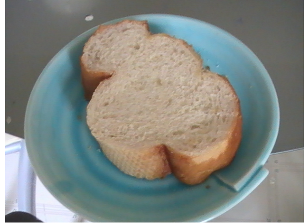
Bring a loaf of bread